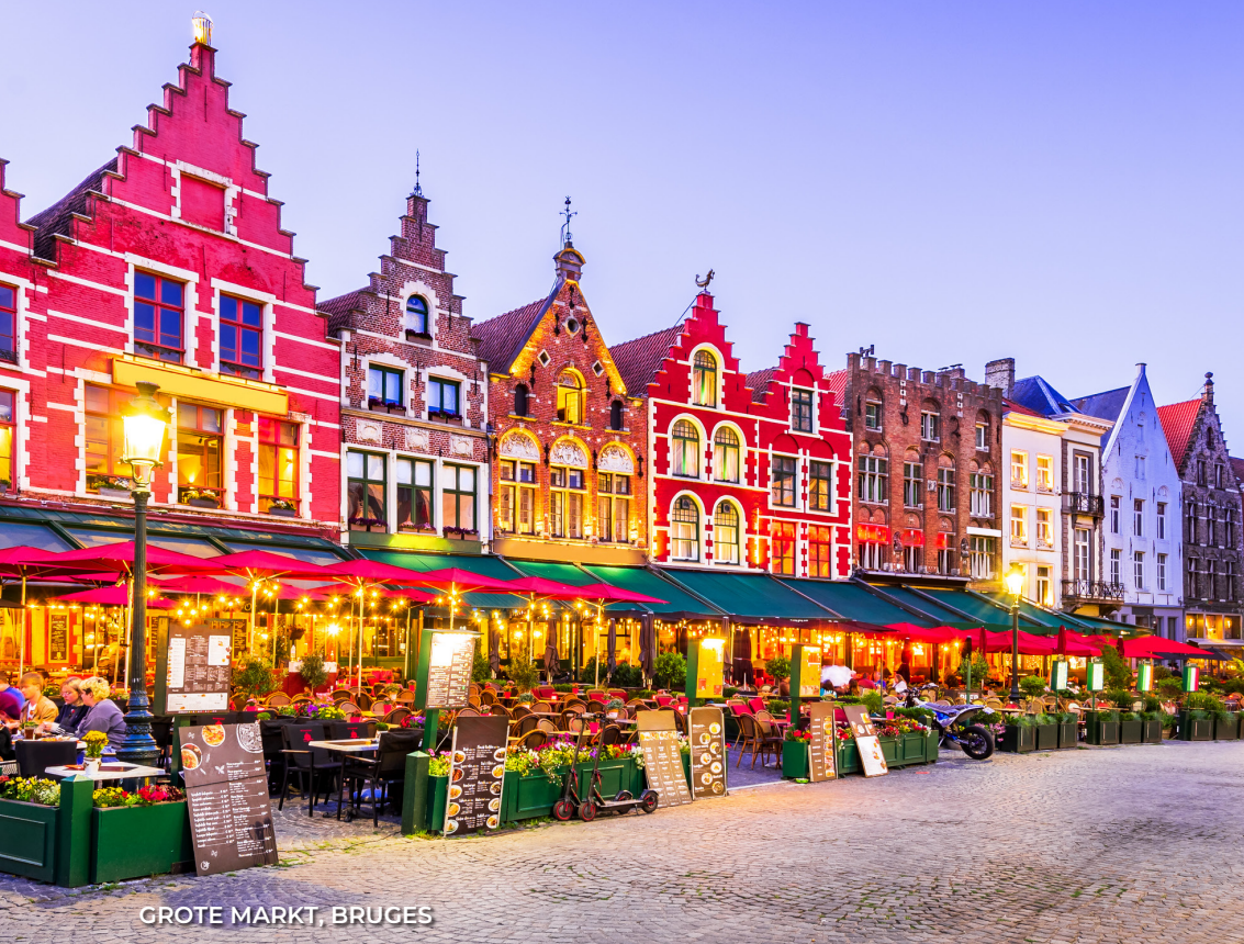
GROTE MARKT, BRUGES