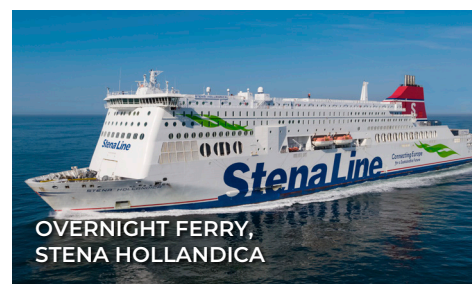
OVERNIGHT FERRY, STENA HOLLANDICA

In the morning, explore Zaanse Schans , a picturesque windmill village on the river Zaan. Marvel at original 18th and 19th-century architecture, including functioning windmills and wooden houses. Witness artisans in action, including a clog maker crafting traditional Dutch wooden shoes. In the afternoon, relax or opt for a trip to the charming fishing village of Volendam, known for its old harbor and colorful houses. Optional: Volendam with Lunch