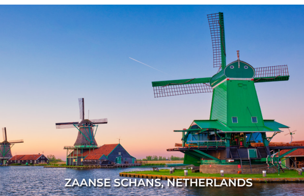
ZAAANSE SCHANS, NETHERLANDS