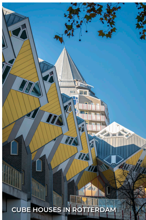
CUBE HOUSES IN ROTTERDAM

Spend the day at your leisure. Enjoy a spot of shopping or explore the city at your own pace. You may wish to take up an optional day tour to visit some of the top attractions outside of London on this day trip to Stonehenge, a prehistoric stone monument that rises imperiously from Salisbury Plain, then continue to the UNESCO-listed city of Bath to discover this gorgeous 18th-century city independently. Optional: Stonehenge and Bath Tour