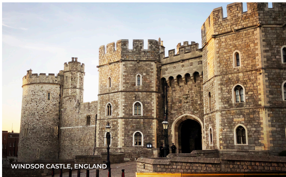
WINDSOR CASTLE, ENGLAND